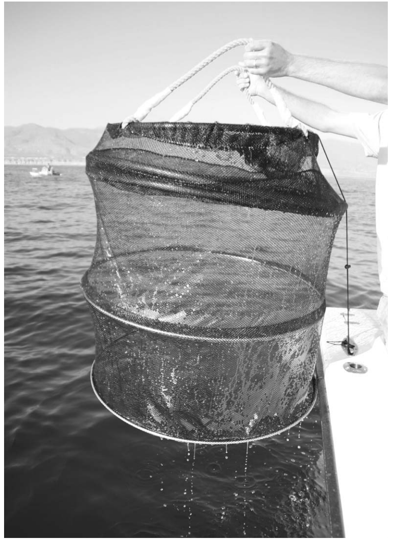
PROMAR'S 36" X 38", 165-GALLON BAIT NET has several applications for private boaters.

The Promar Bait Hotel is great for saving bait for a day or two. Back when I used to go down to L.A. Bay with a 14-foot skiff, we used to use a trash can with a bunch of holes in it and a couple of bricks in the bottom to keep our mackerel in overnight. Flow was always an issue. After all, the drilled in holes only let so much flow go in and out. There was more than one morning where we discovered we put too many